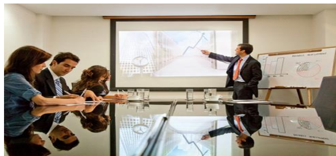
WOW your Audience with the Presentation

It is unavoidable in a leadership role that a manager needs to communicate effectively to all levels. An age old aphorism goes, "It's not what you say, but how you say it." Communication is what separates a poor leader from an exceptional one. Good solid organizational communication eliminates barriers; resolve problems and builds stronger workplace relationships for increased productivity. Having effective communication skills is the key to good leadership.