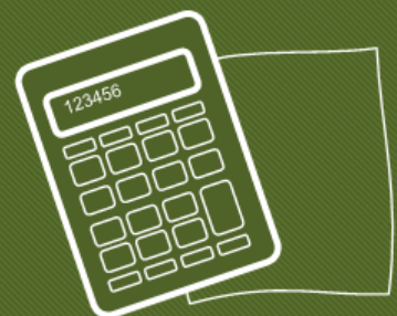
Financial Decision Making for Non Finance Manager